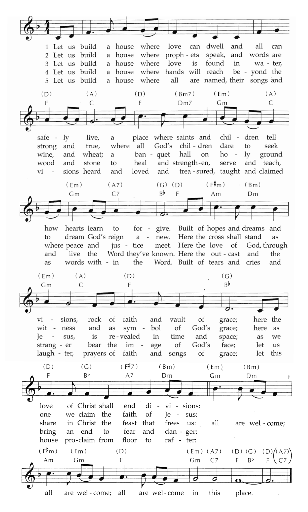
Words: Marty Haugen © 1994, GIA Publications, Inc.; Music: TWO OAKS, Marty Haugen © 1994, GIA Publications, Inc. Reprinted with permission under ONE LICENSE #A-722558. All rights reserved.